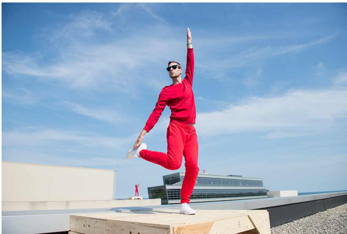
"In Plain Site," by Trisha Brown Dance Company and presented by ArtPower, will be performed on the UC San Diego campus.